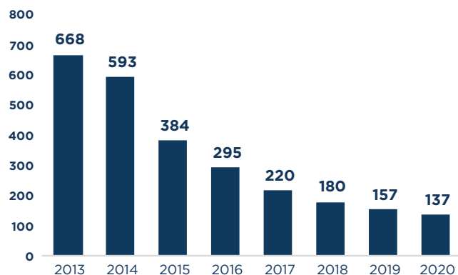
CHART 3 Global battery prices, in USD per unit

Battery makers and their customers are trying to reduce the reliance of this industry on cobalt, but also to find an alternative source of energy. Hydrogen is generally cited as a strong alternative, able to alleviate all the costs incurred by equipment makers and the burden on the environment. It has the advantage of being environment-friendly, as hydrogen is almost ubiquitous and non-pollutant. However, for mass-market cars and the premium segment, this technology is simply not efficient enough compared to the ICE and EV 18 . Furthermore, the technology needs additional years of research and development to be mature enough, but only for trucks, and will be in a deep competition with batteries, whose characteristics were detailed above. We do not expect hydrogen to be a game-changer in this decade without strong incentives from public authorities. Additionally, players in the battery ecosystem, which includes end-users such as carmakers, will not be incited to favour hydrogen in the near-term as they invested heavily, under the coercive action of authorities, in batteries and their chemistry to comply with stringent regulations.