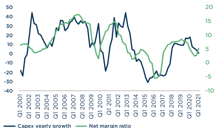
CHART 2 Global metal industry capex and net margin evolution