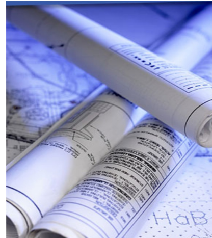
R and D offices